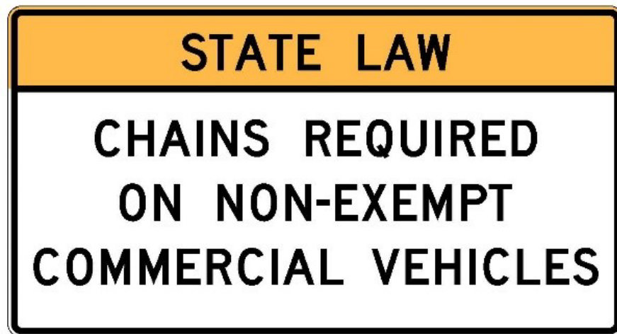
Figure 2B-34. Chains Required On Non-Exempt Commercial Vehicles Sign

10. Figure 2B-34. Chains Required on Non-Exempt Commercial Vehicles Sign. On page 102, add the following figure: