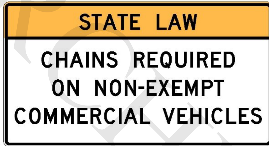
Figure 2B-34. Chains Required On Non-Exempt Commercial Vehicles Sign

10. Figure 2B-34. Chains Required on Non-Exempt Commercial Vehicles Sign. On page 102, add the following figure: