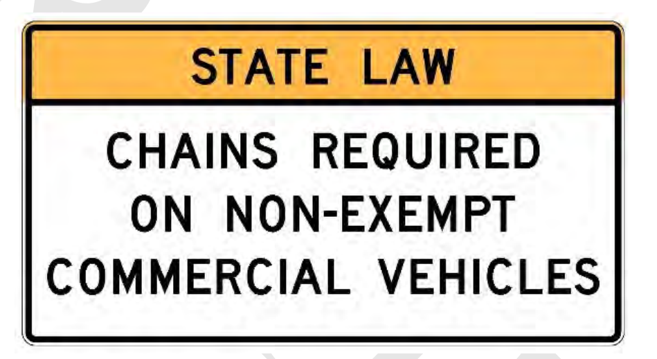
Figure 2B-34. Chains Required On Non-Exempt Commercial Vehicles Sign

10. Figure 2B-34. Chains Required on Non-Exempt Commercial Vehicles Sign. On page 102, add the following figure: