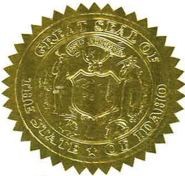
BRAD LITTLE GOVERNOR

IN WITNESS WHEREOF, I have hereunto set my hand and caused to be affixed the Great Seal of the State of Idaho at the Capitol in Boise on this 31st day of January in the year of our Lord two thousand and twenty-two.