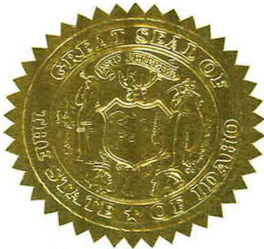
BRAD LITTLE GOVERNOR

IN WITNESS WHEREOF, I have hereunto set my hand and caused to be affixed the Great Seal of the State of Idaho at the Capital in Boise on this 31st day of August in the year of our Lord two thousand twenty-one.